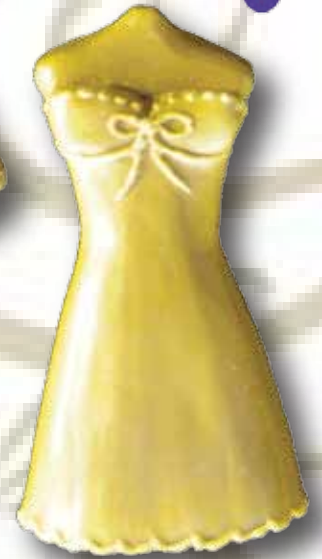
Ref: 1725 13,5x7,5cm