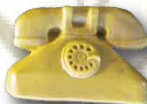
REF: 1728 6,4x9,5cm