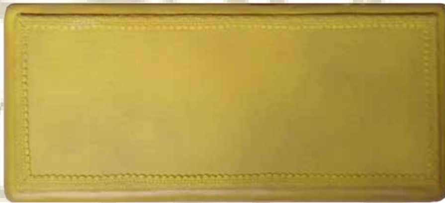
Ref: 1750 26x58 cm