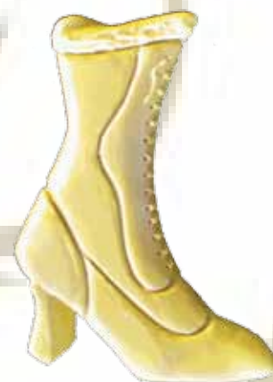
Ref: 1740 16x12,5cm