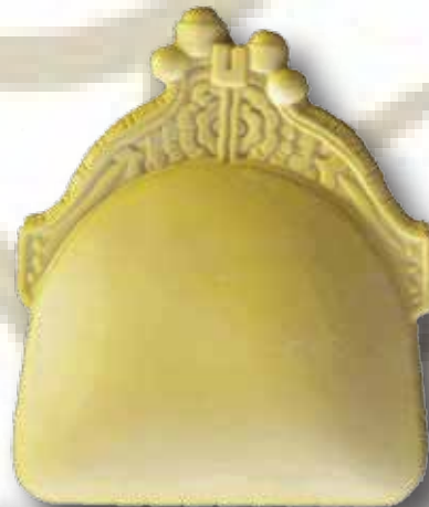
Ref: 1566 11x13cm