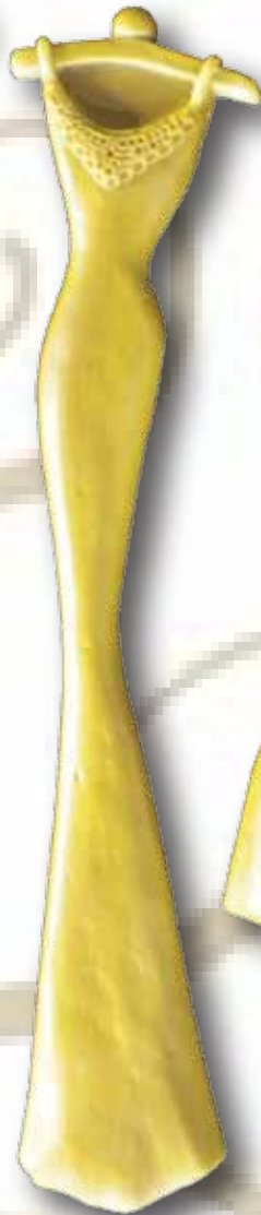
Ref: 1723 33x6cm