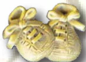
Ref: 1743 6,5x9,3cm