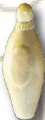
REF: 1745 11,5x4cm