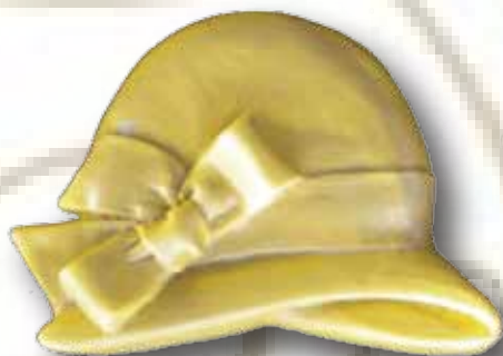
Ref: 1731 13x17cm