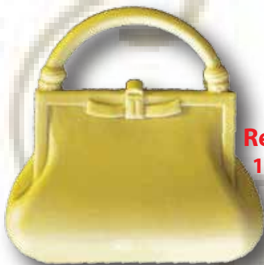
Ref: 1564 14x14cm