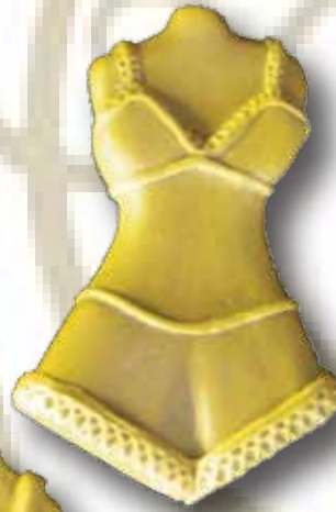
Ref: 1726 11x7cm