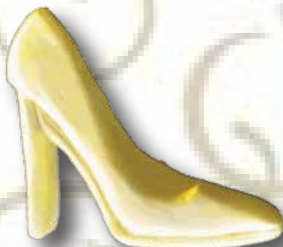
Ref: 1738 13x12,5cm