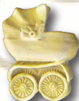
Ref: 1741 11x8,5cm