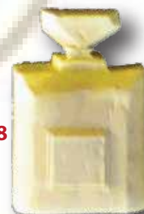
REF: 1748 7x5cm