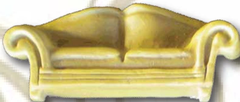
REF: 1729 5,7x15cm