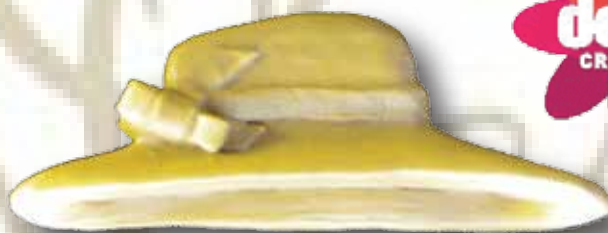
Ref: 1732 8,5x23cm