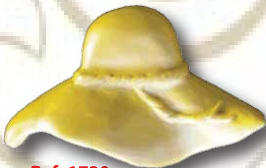
Ref: 1730 11,2x18,5cm