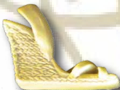
Ref: 1736 9x10,2cm