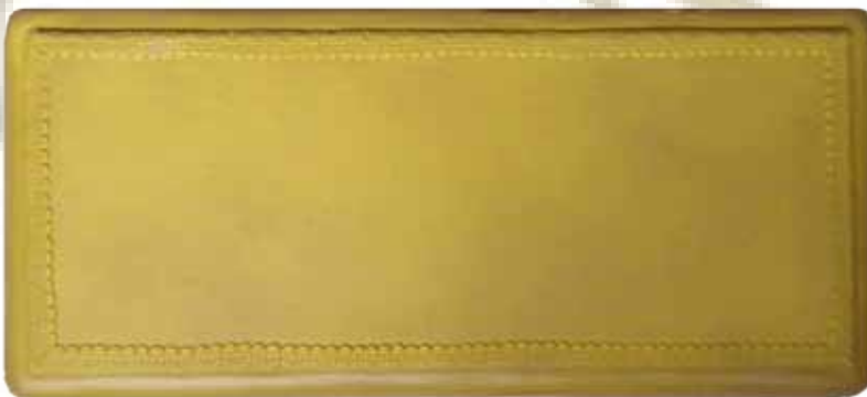
REF: 1750 26x58 cm