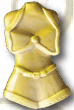
Ref: 1727 10,5x6,8cm