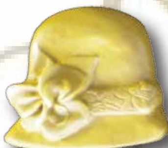
Ref: 1733 10x11cm