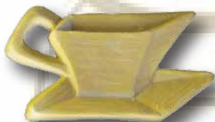
REF: 1609 14x9cm