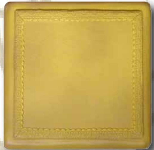
REF: 1749 26x26 cm