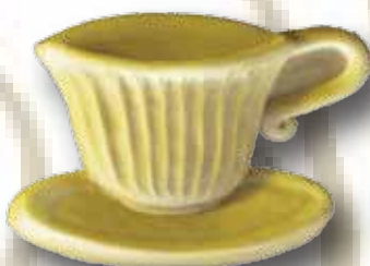
REF: 1610 14x9cm