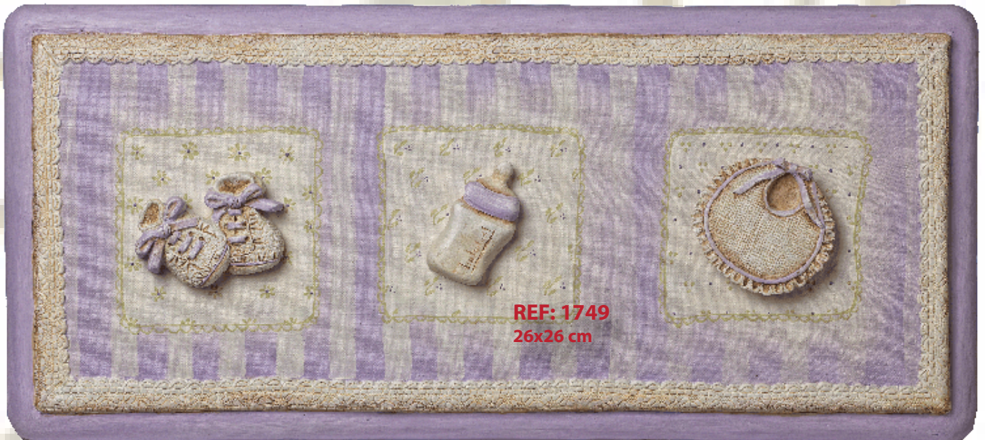
REF: 1749 26x26 cm