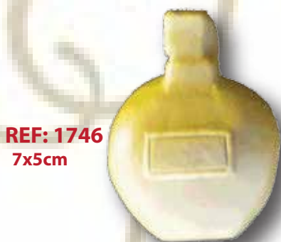
REF: 1746 7x5cm