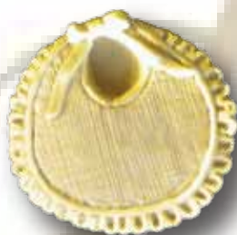
Ref: 1742 7,5x8cm