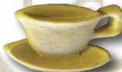
REF: 1611 14x9cm