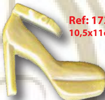
Ref: 1739 10,5x11cm