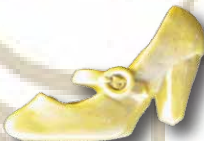
Ref: 1737 9,5x13cm