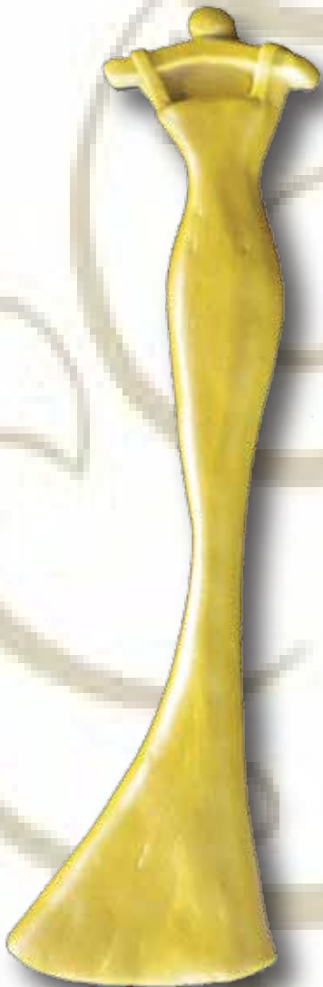
Ref: 1722 30,5x8cm