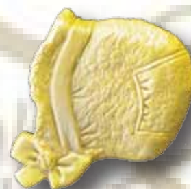
Ref: 1734 9,5x14,5cm