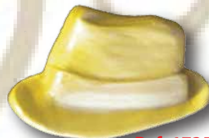
Ref: 1735 9x9,5cm